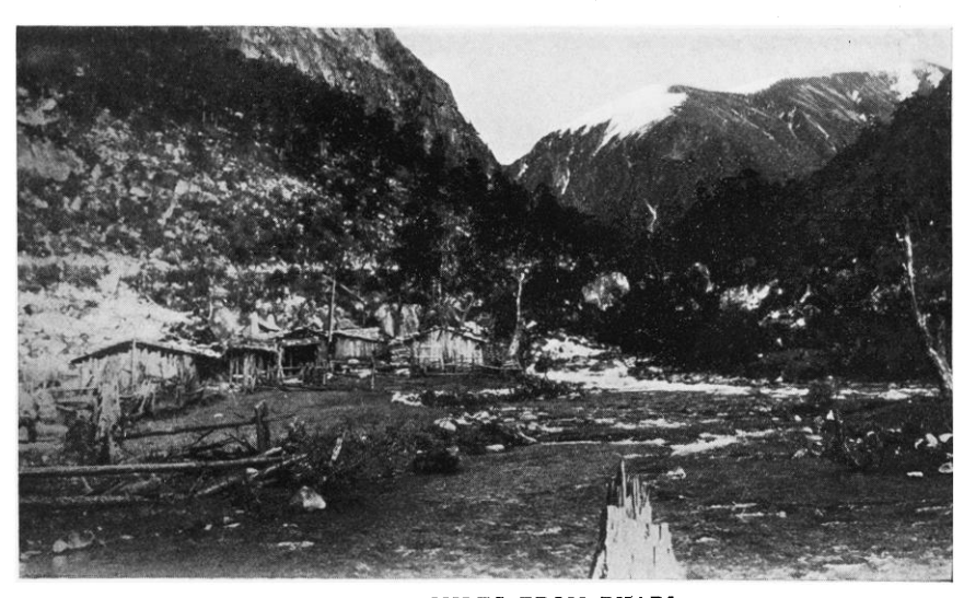
GAUTSA, 16 MILES FROM PHARI