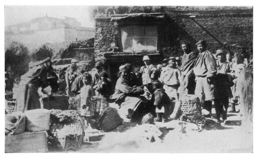
THE BAZAR AT PHARI