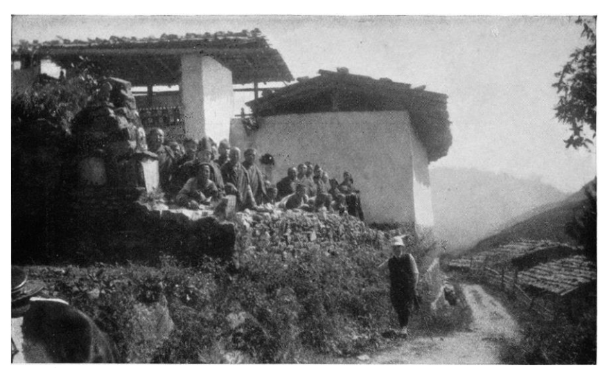
KAGIN MONASTERY ABOVE CHUMBI VALLEY ON WAY DOWN FROM NATHU LA